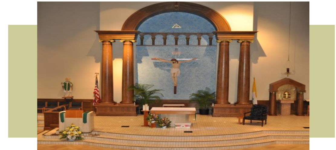
PARISH OFFICE - 352.629.8092