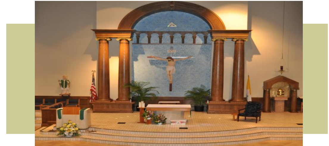
PARISH OFFICE - 352.629.8092